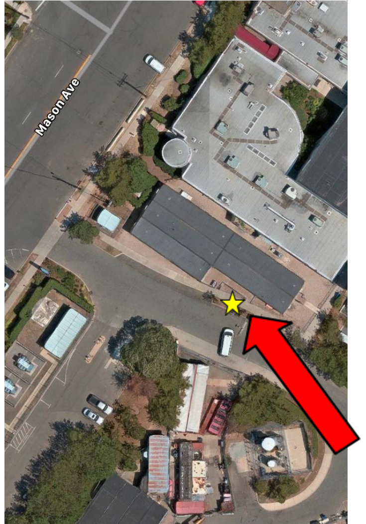
Maps 1&2 - SIUH North EMS Trailer Location